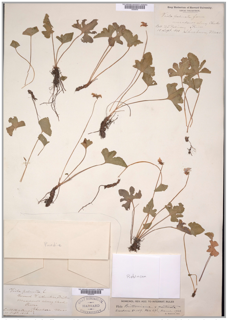
Figure 3. Holotype of Viola × lesmehrhoffii —Robinson s.n. (GH), the upper right label on the sheet.

Greenman s.n. (GH!). Norfolk County. Dedham, Charles River Meadows, 4 Aug 1905, Forbes s.n. (NEBC!). Dedham, knoll by wells, 23 May 1906, Forbes s.n. (NEBC!; #4)