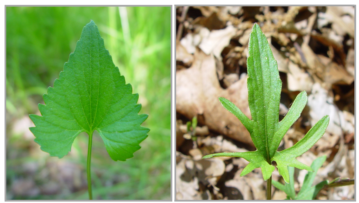
Figures 1 (left) and 2 (right). 1—leaf blade of Viola pectinata during vernal flowering. 2—leaf blade of V. brittoniana during vernal flowering.